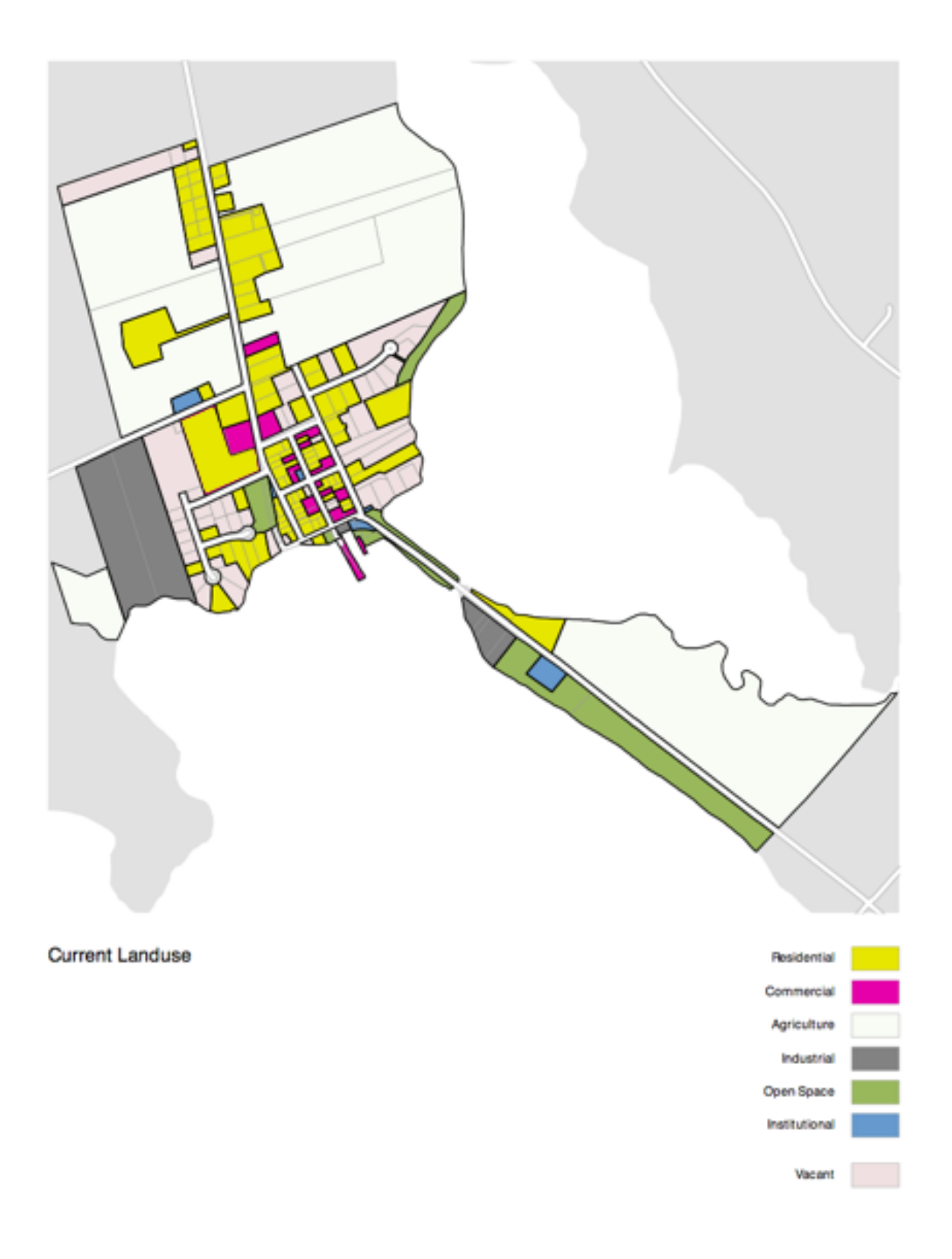
Figure 1: Existing Land Use